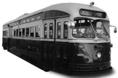
TORONTO Maroon and Cream