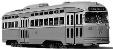
JOHNSTOWN (KENOSHA) Orange

Each Kenosha streetcar has a name and color scheme that represents the legacy of streetcar transportation in the United States.