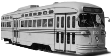
CINCINNATI Yellow and Green