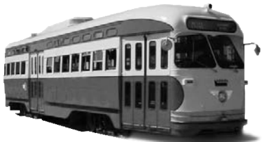
PITTSBURGH Red and Cream