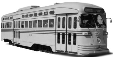
CINCINNATI Yellow and Green