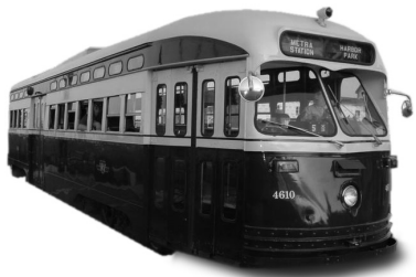
TORONTO Maroon and Cream