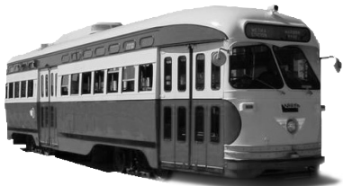
PITTSBURGH Red and Cream